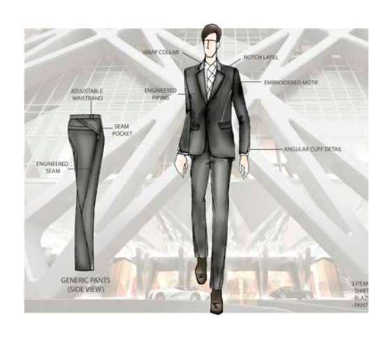
5. Design Sketches of Employee uniforms