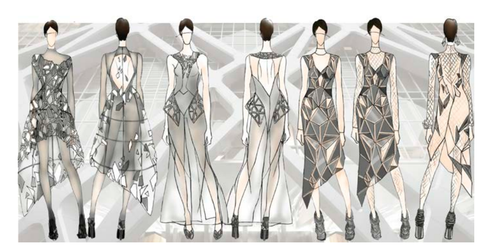
6. Design Sketches of Employee uniforms